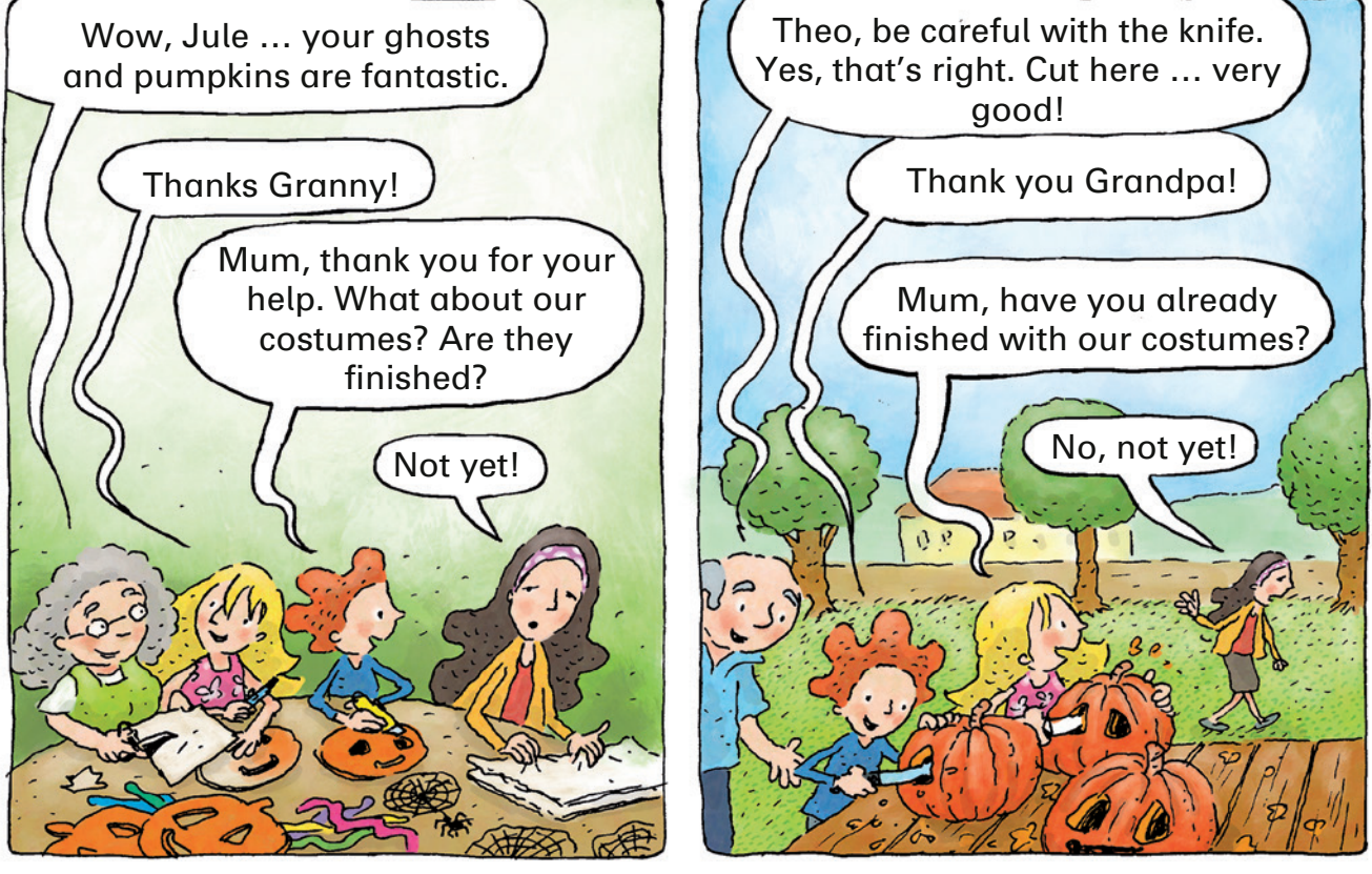
6 Read and listen to the story CD-track 2 "Halloween", do a rhyme and WS 1 "Halloween" on p. 65. US 2.